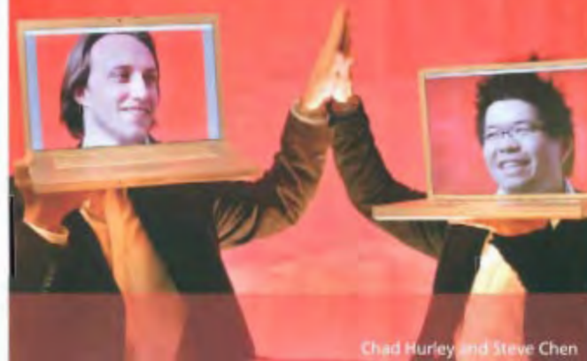
Chad Hurley and Steve Chen

JAWED KARIM is a college student with a difference. For a start, he is not worried about the $100,000 cost of his Ferrari because he is already a millionaire. He first hit the jackpot in 2002 when eBay bought the online payment company he was working for. Then, in November 2006, he got lucky again when Microsoft agreed to buy YouTube for $1.65 billion.