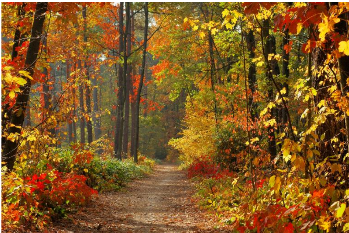
Colors Of Fall