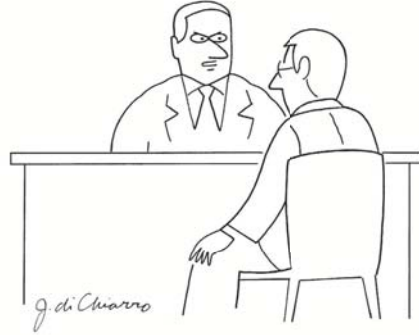
"This collaboration would work better if you kept your ideas to yourself."

3 Imagine you're putting together a project team. All the people on your shortlist have the right expertise and skills. So what personal qualities are you looking for? Compare ideas with your group.